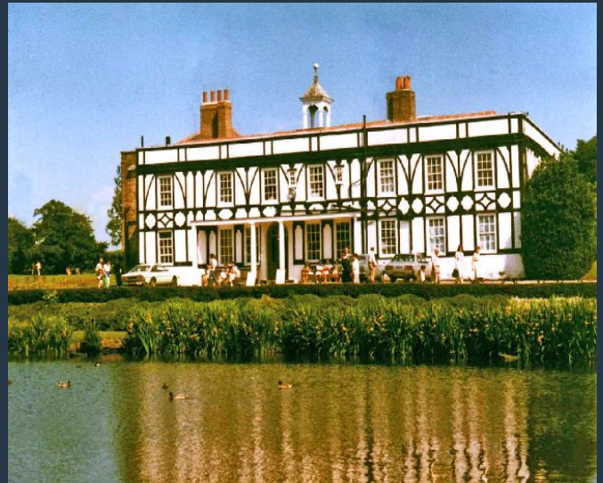
Broomfield House c.1980 prior to damage caused by a series of fires.